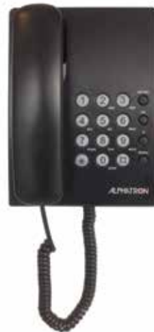
TX500 Cabin station with magnetized handset for wall mounting.